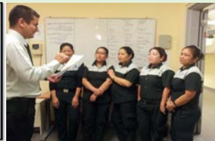
DREAM Ready Mix